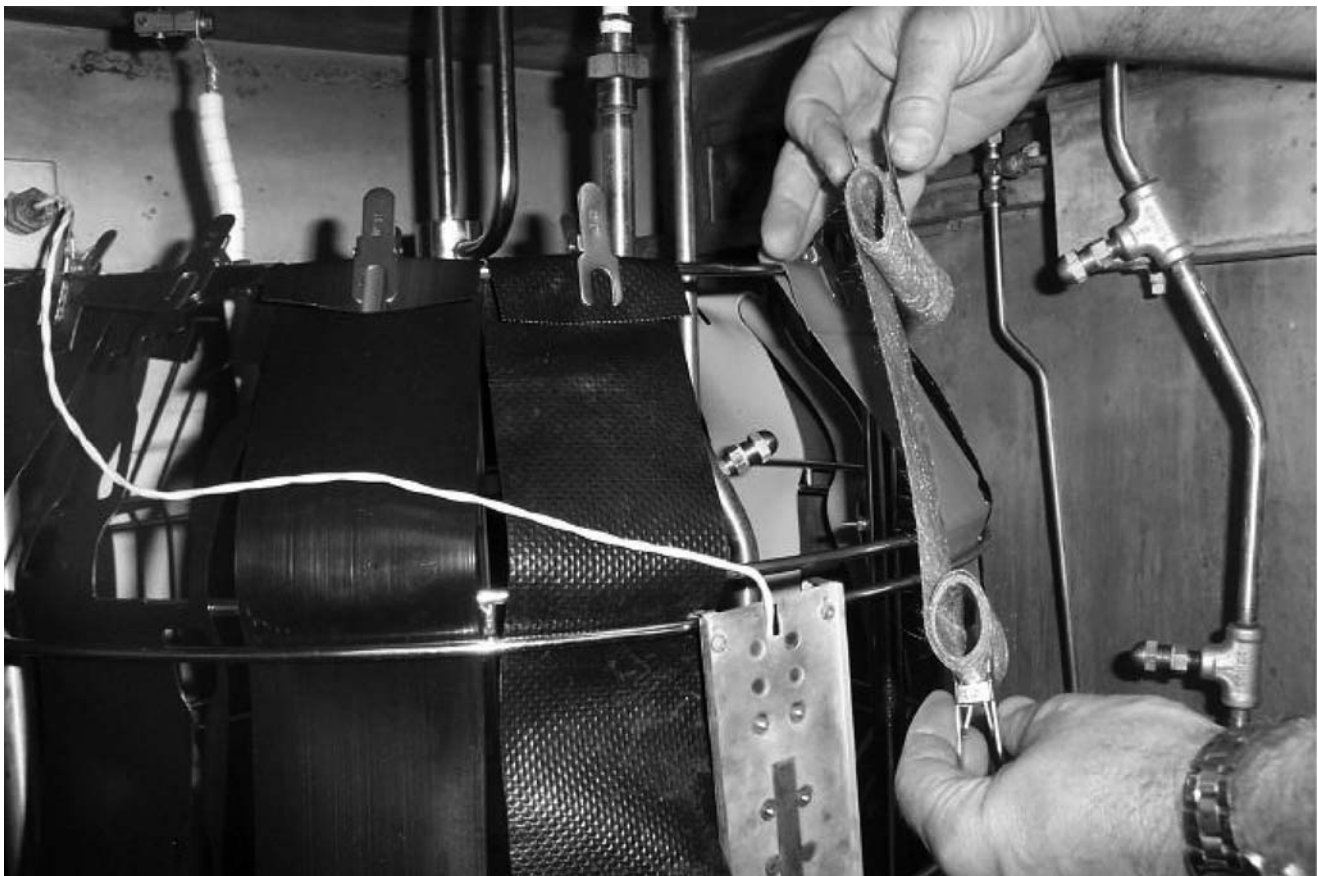
FIG. 2 Roller Grip Specimen Ready for Placement in Weatherometer