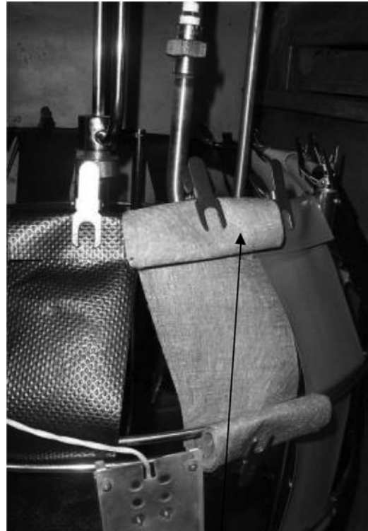
NOTE 1—When placing specimens to be tested using roller grips in weatherometer the rolled area in the clamp needs to be protected from exposure to UV to avoid degradation of this area (see arrow).

NOTE 8—Practice G 155 does not specify a particular irradiance level. Various options are listed in Table X3.1 of the appendix in Practice G 155.